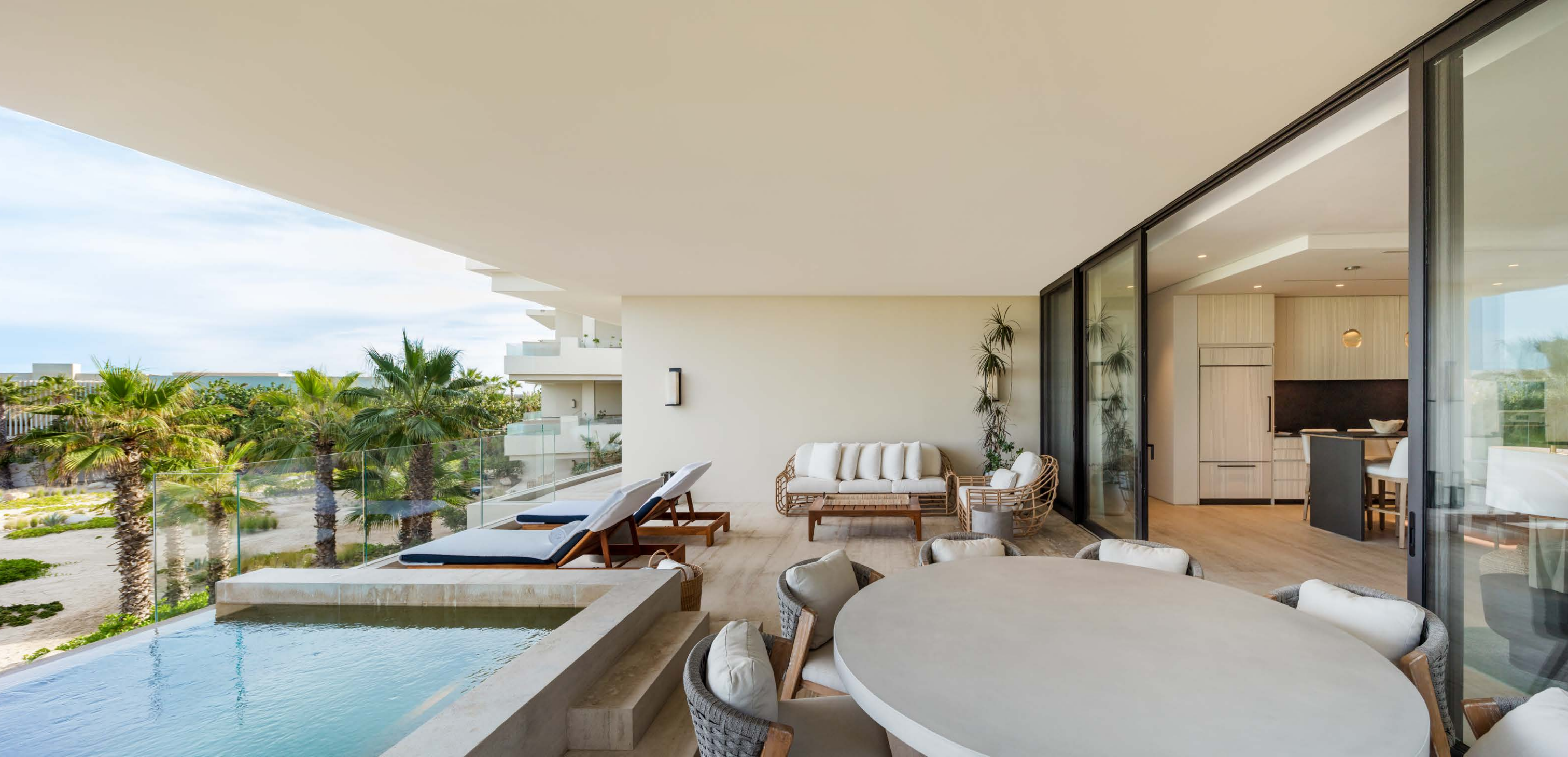
Outdoor Living Area