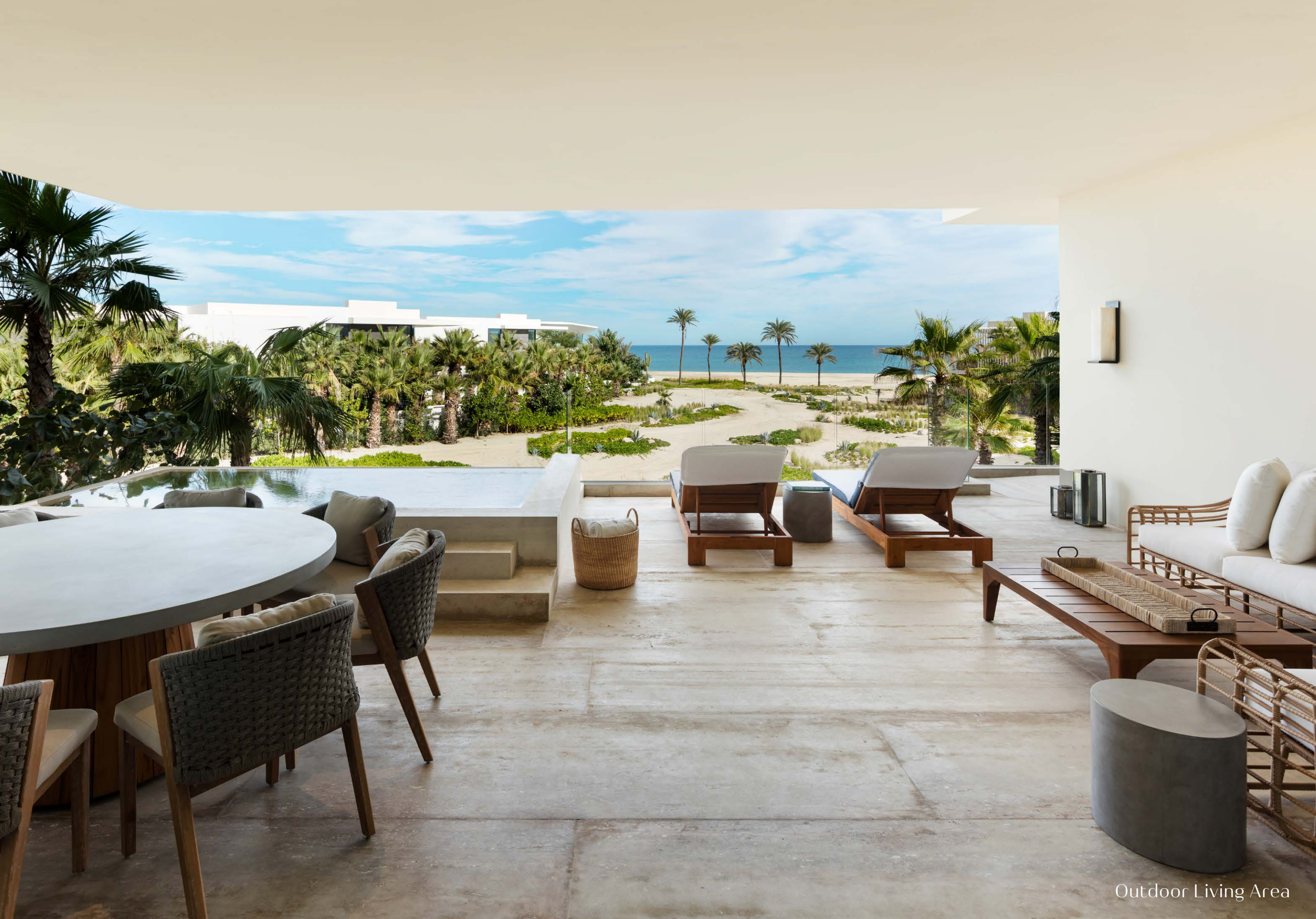
Outdoor Living Area