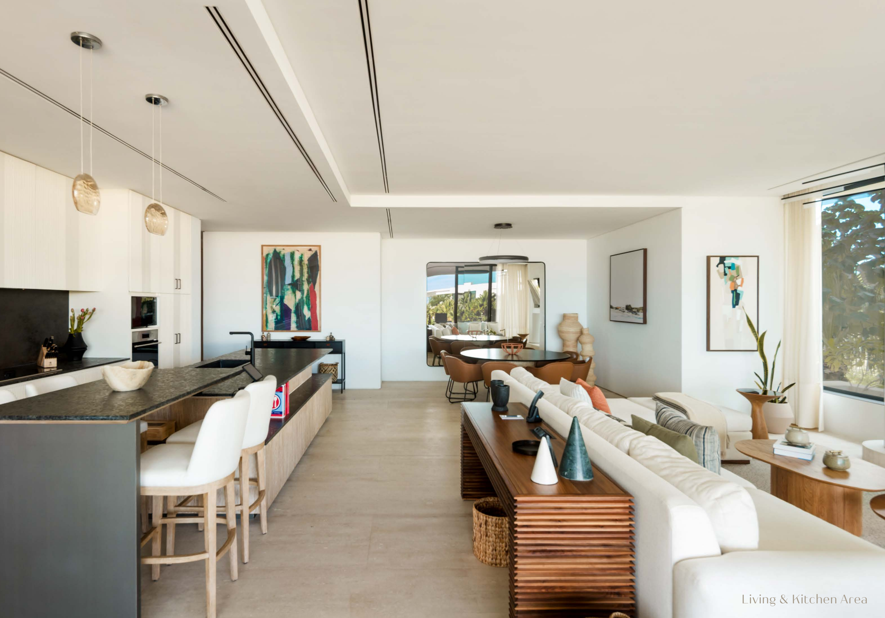
Living & Kitchen Area