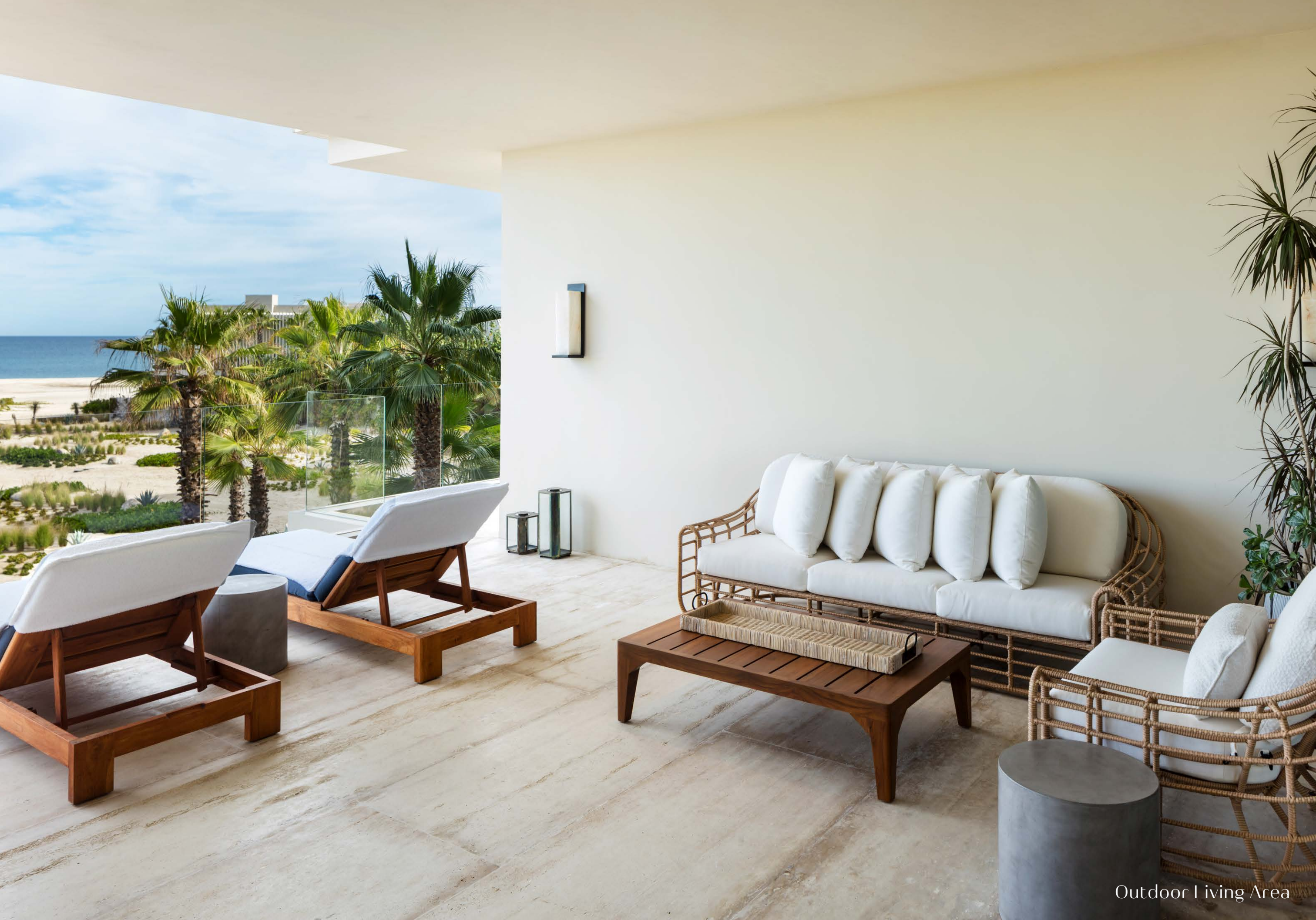
Outdoor Living Area